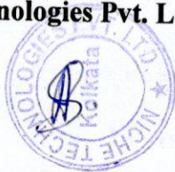
Ashok Sen (Authorised Signatory)